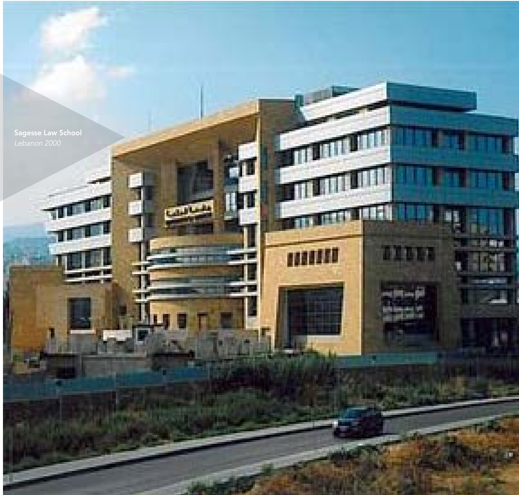
Sagesse Law School Lebanon 2000