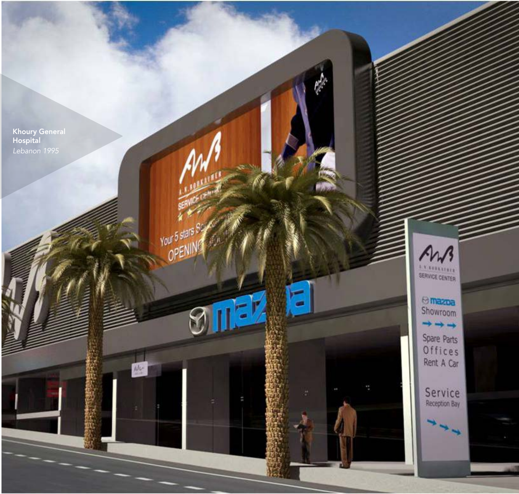
Khoury General Hospital Lebanon 1995