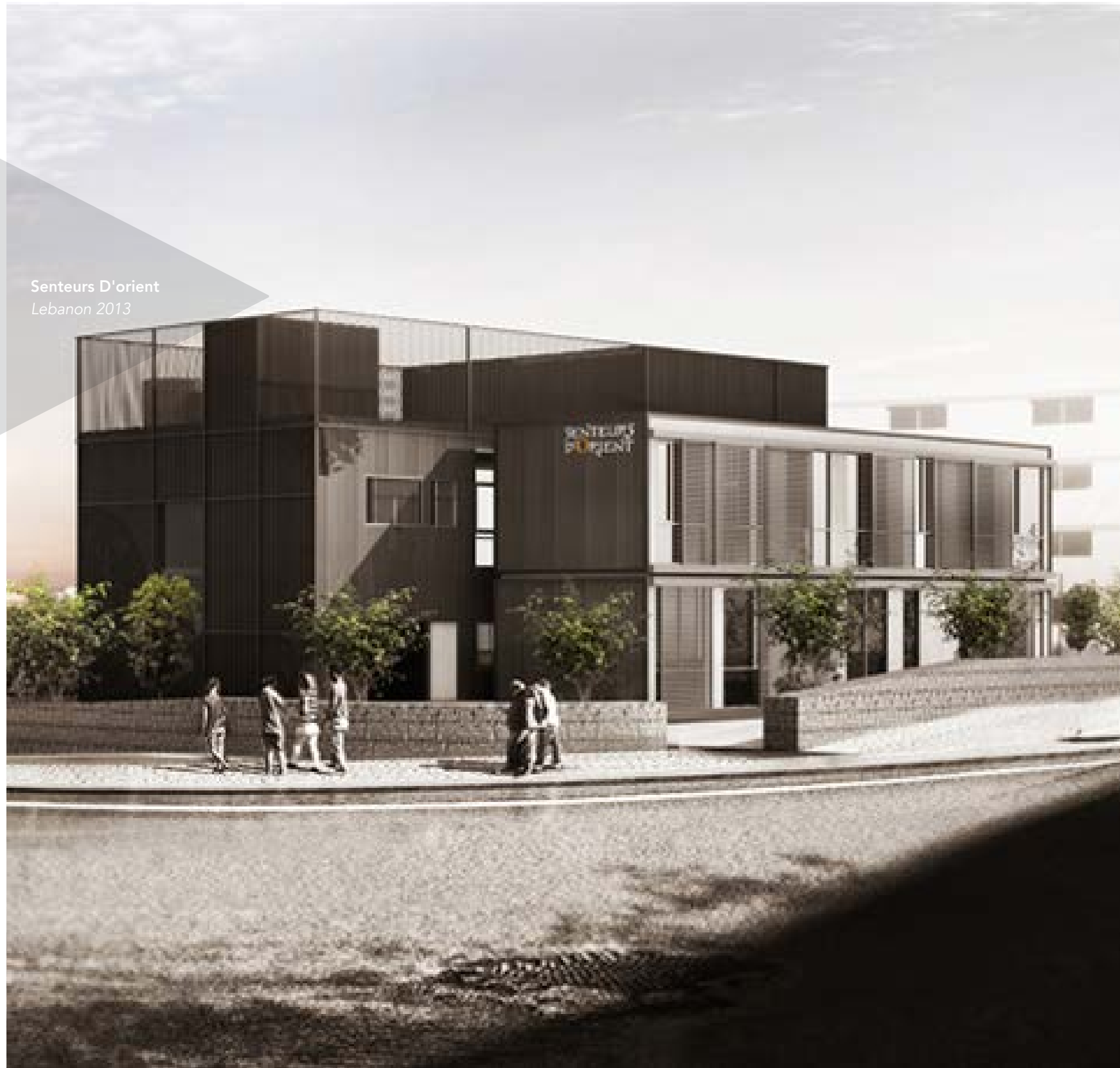
Senteurs D'orient Lebanon 2013