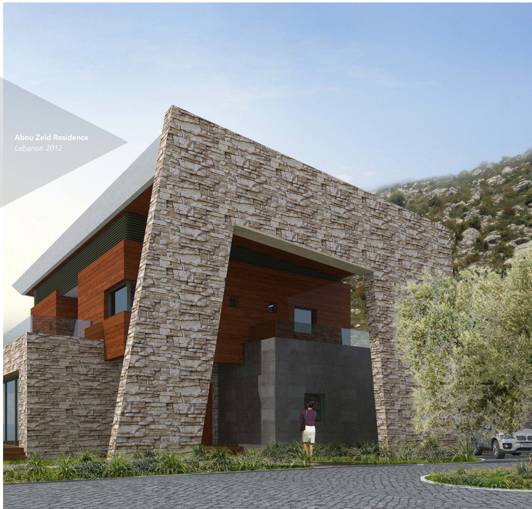
Abou Zeid Residence Lebanon 2012