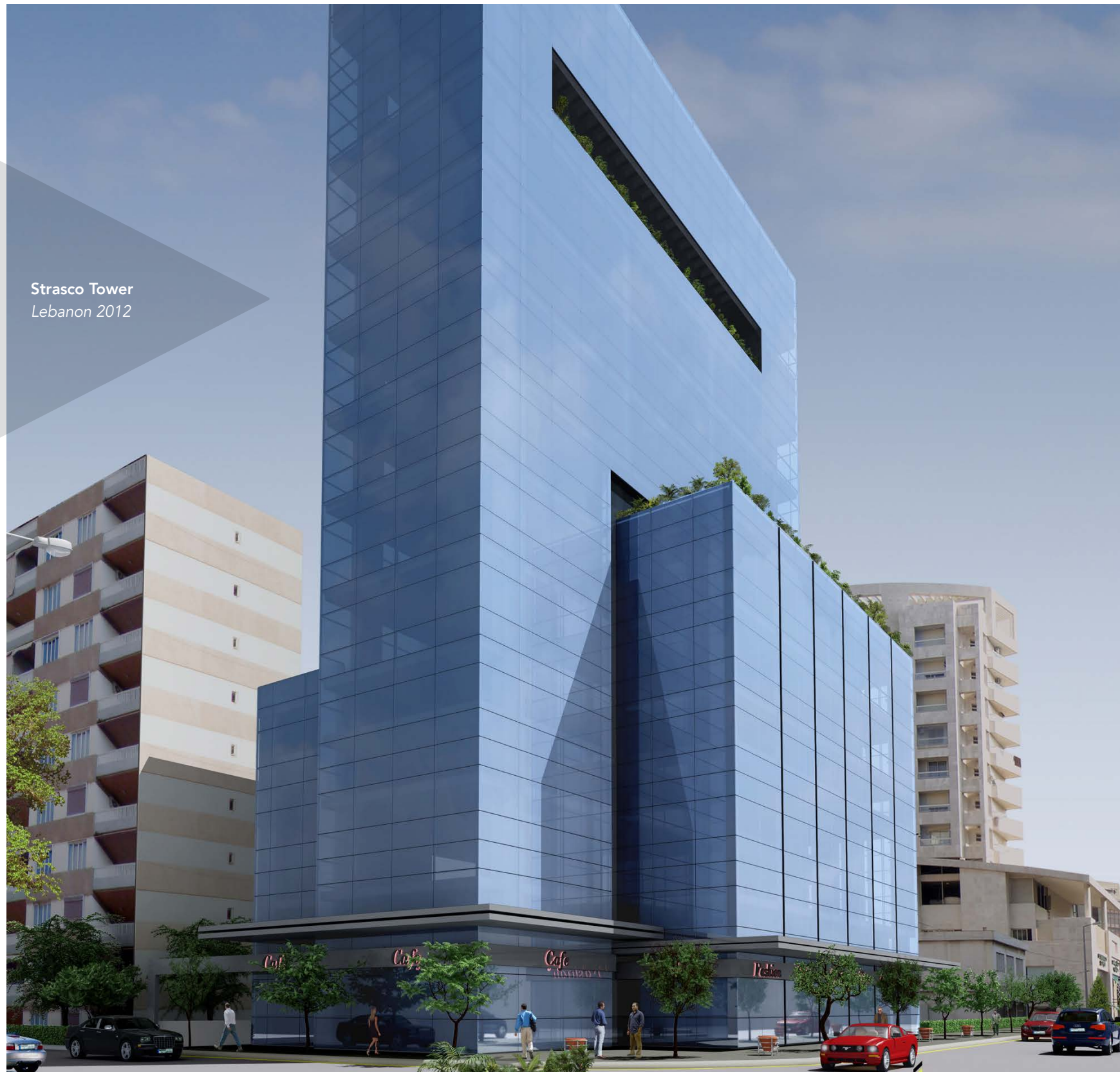
Strasco Tower Lebanon 2012