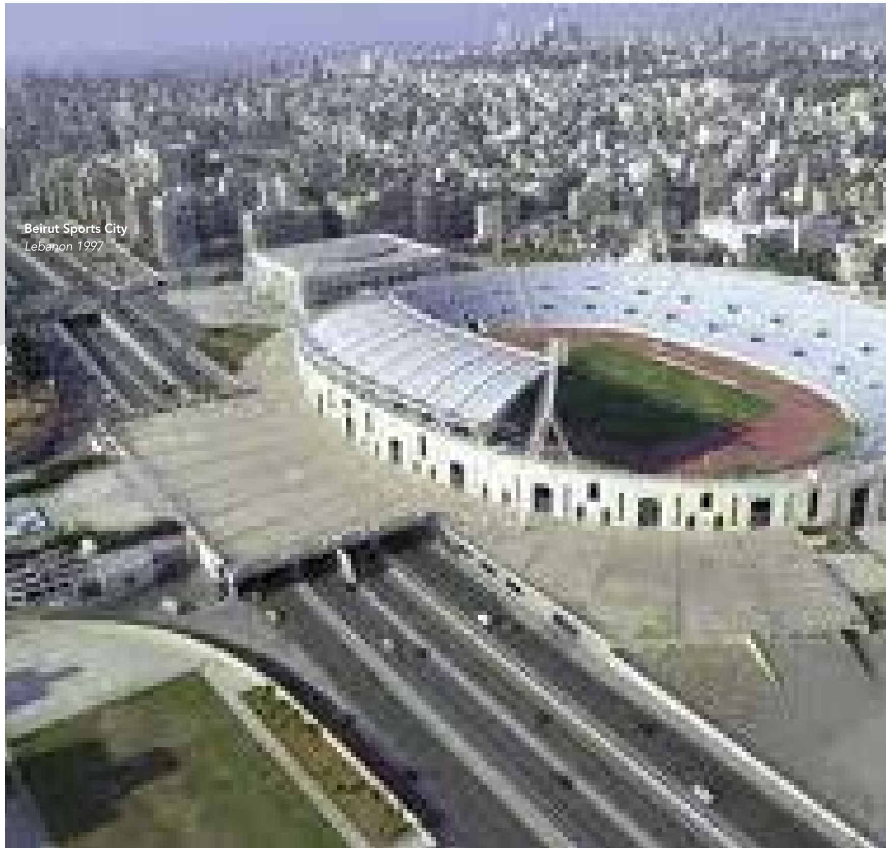
Beirut Sports City Lebanon 1997